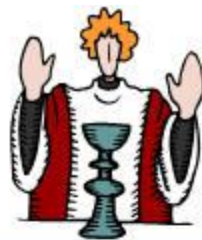
Apostle or Pastor