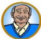
Elder or Deacon