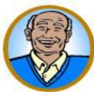
Elder or Deacon