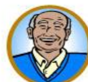
Elder or Deacon